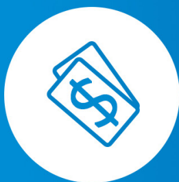
Value For Money