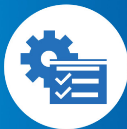
Full Featured Payment Gateway